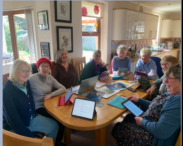
The playreaders taking a short rest